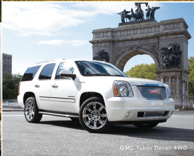
GMC Yukon Denali 4WD