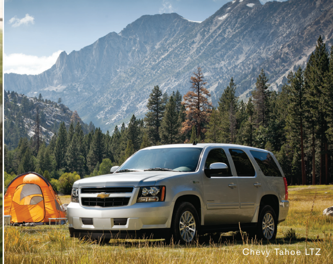
Chevy Tahoe LTZ