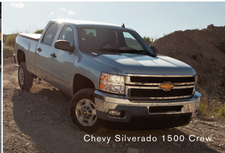
Chevy Silverado 1500 Crew