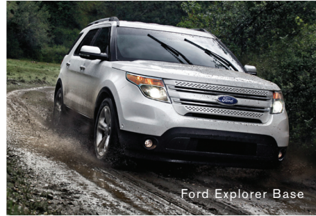
Ford Explorer Base