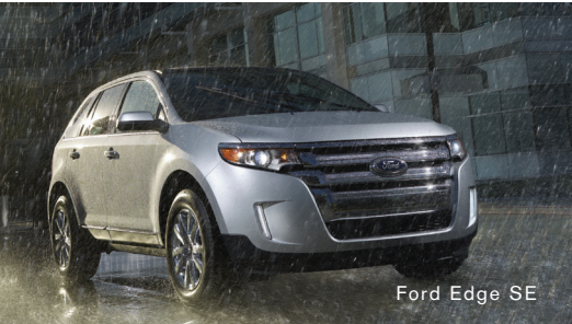
Ford Edge SE