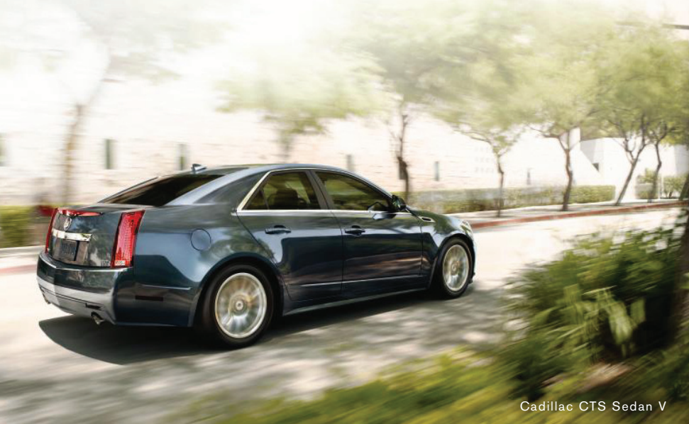
Cadillac CTS Sedan V