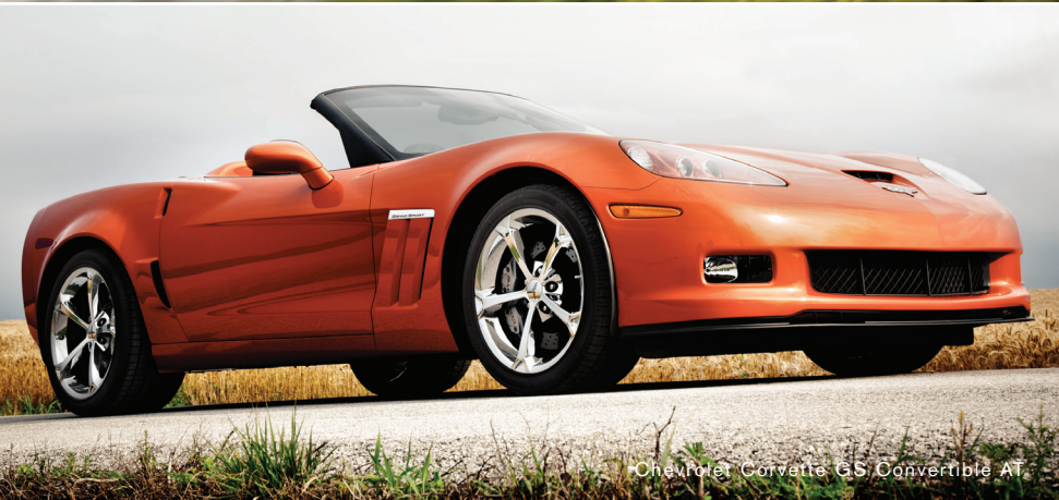
Chevrolet Corvette GS Convertible AT