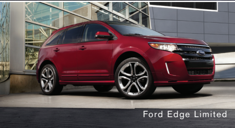
Ford Edge Limited