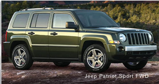
Jeep Patriot Sport FWD