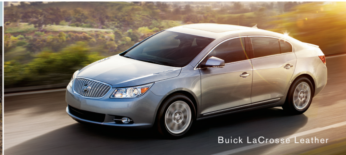
Buick LaCrosse Leather