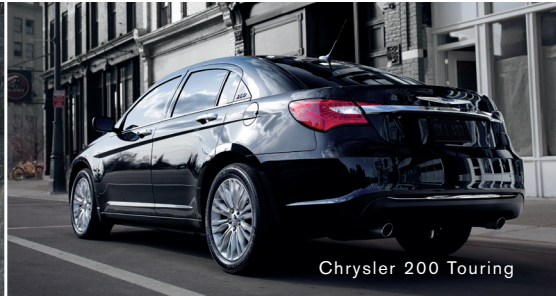
Chrysler 200 Touring