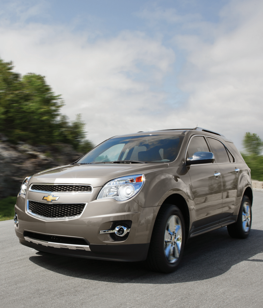
Chevrolet Equinox FWD LS