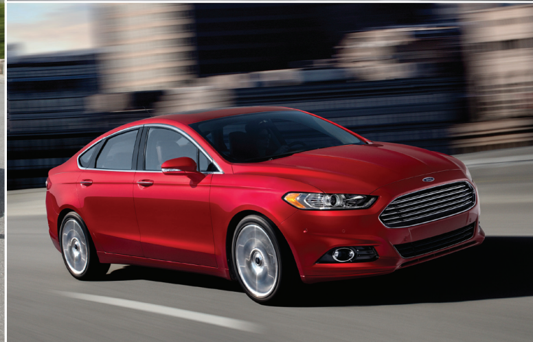
Ford Fusion SE