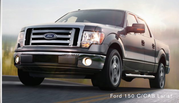
Ford 150 C/CAB Lariat