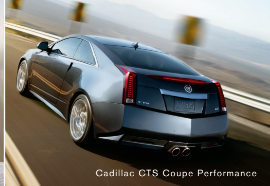
Cadillac CTS Coupe Performance