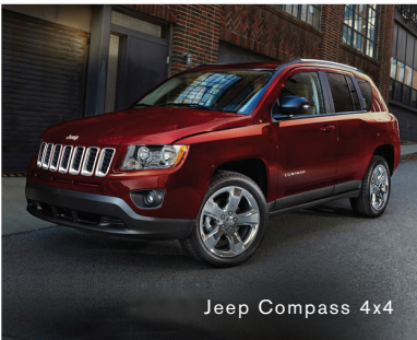
Jeep Compass 4x4