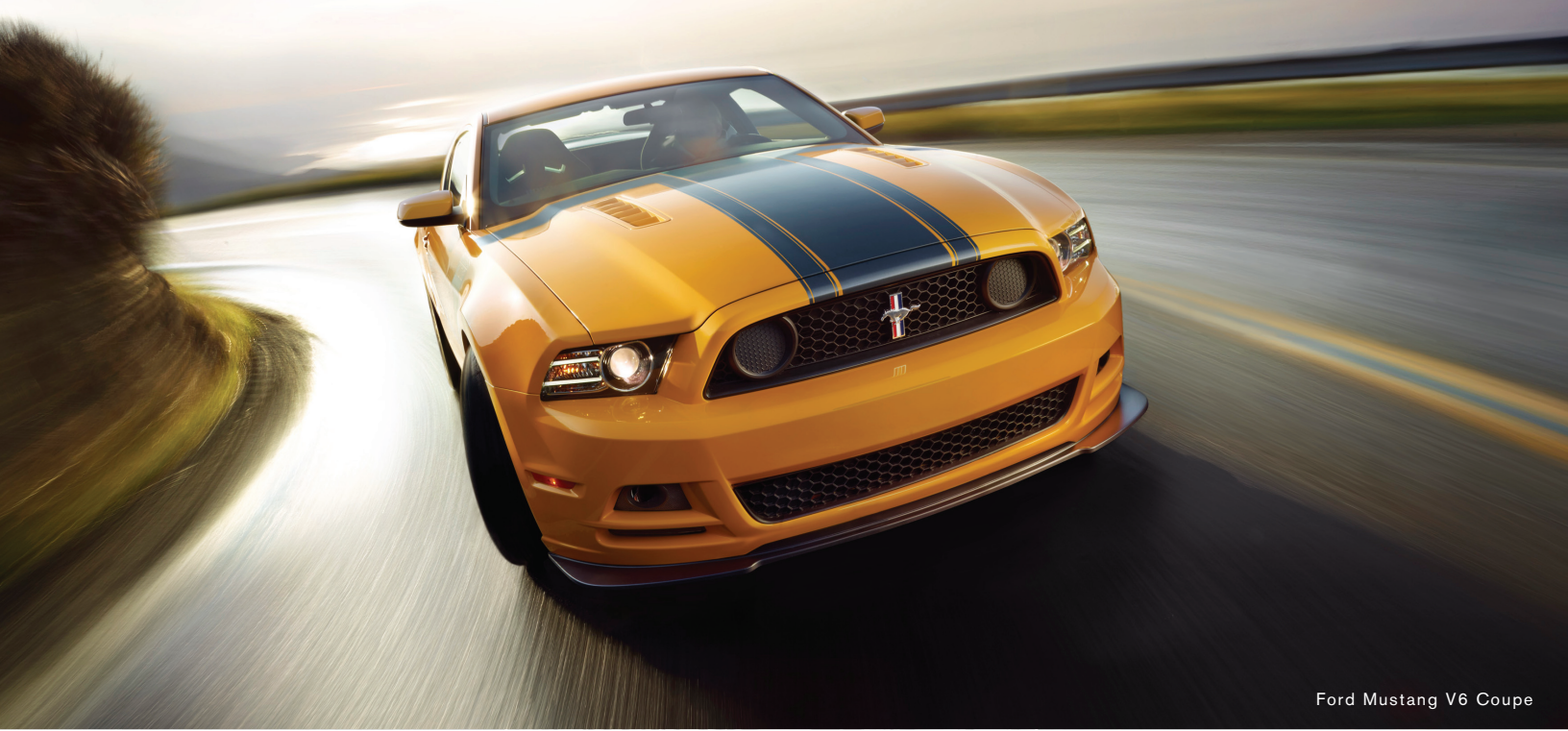
Ford Mustang V6 Coupe