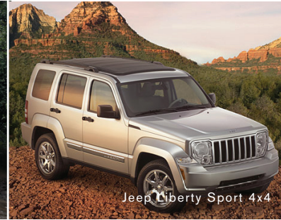
Jeep Liberty Sport 4x4