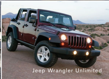
Jeep Wrangler Unlimited