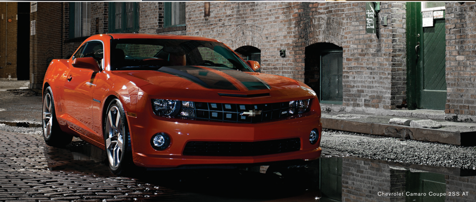
Chevrolet Camaro Coupe 2SS AT