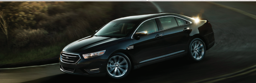
Ford Taurus Limited