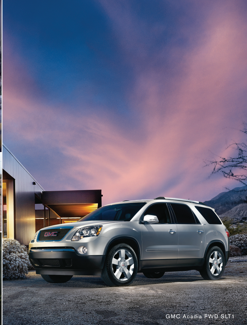
GMC Acadia FWD SLT1