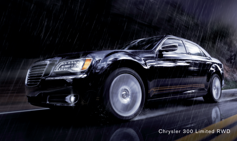
Chrysler 300 Limited RWD