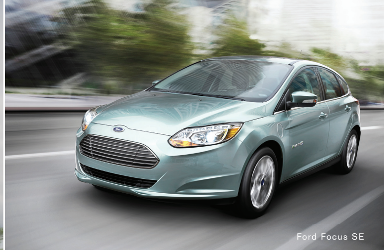
Ford Focus SE