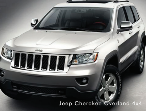
Jeep Cherokee Overland 4x4