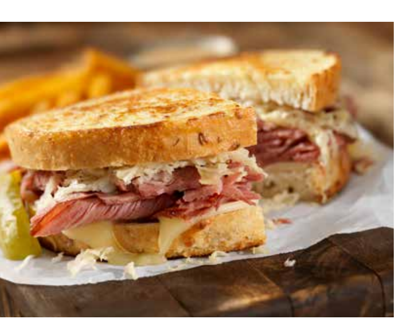
* All food and beverage is subject to 22% service charge and 6% sales tax.

New York Sirloin Steak, $52 pan-seared, three peppercorn sauce