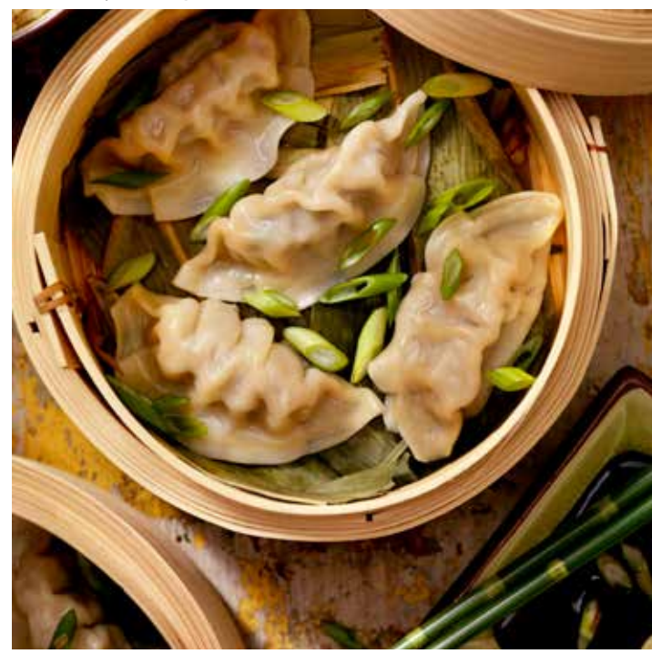
(based on 3 pieces per person)