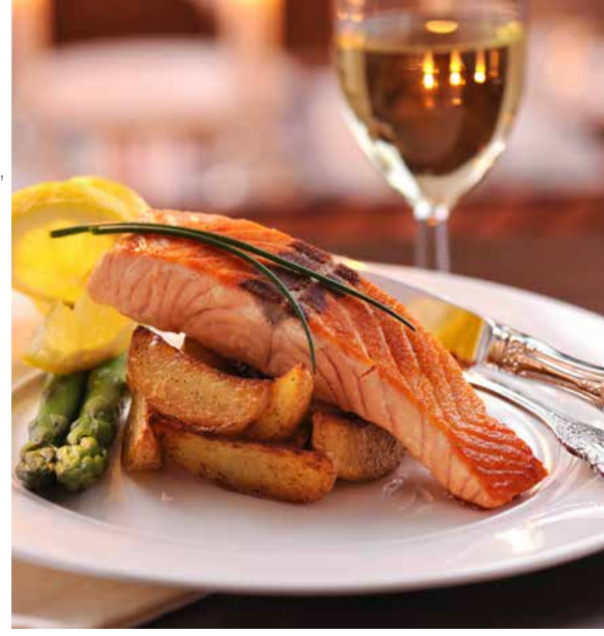
Cornmeal-Dusted Walleye, $55 pan-fried, caper relish

Crab Stuffed Flounder, $60 citron beurre blanc